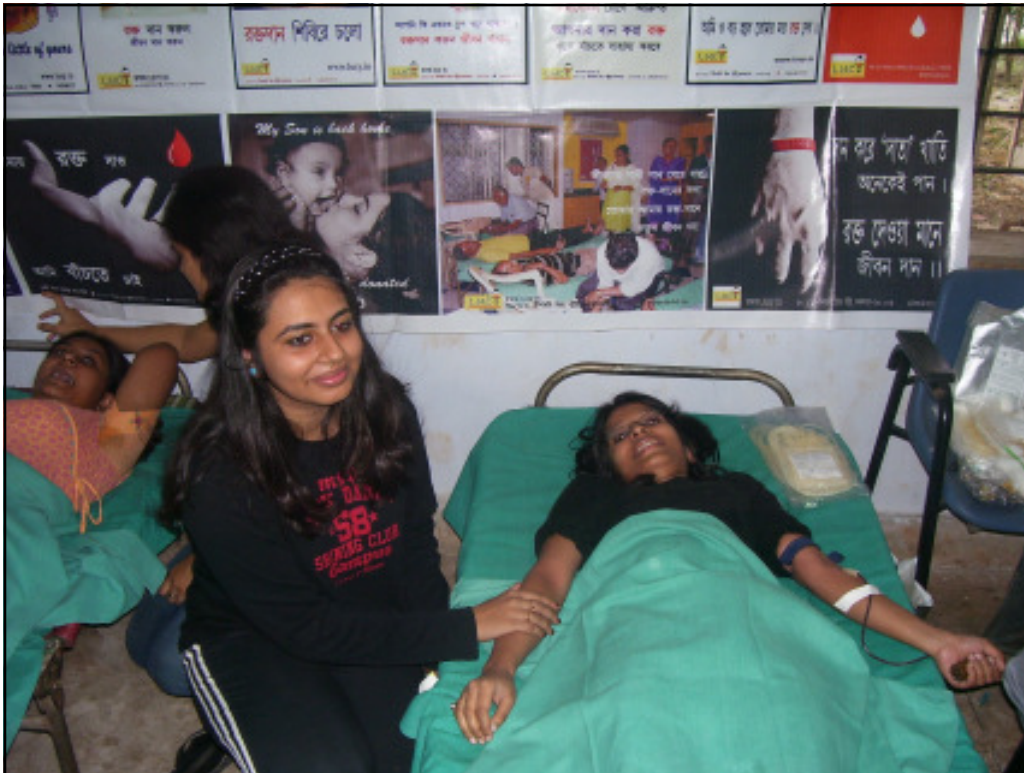
Bedside volunteers with a smiling face encouraging blood donors.

to motivate donors also attract volunteers which in turn affects the reception of donors. These types of situation are to be avoided and volunteers in charge of the reception area should and must stick to their job.