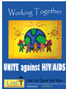
New IEC Material