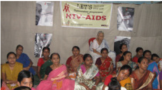
Seminar on World AIDS Day 2009