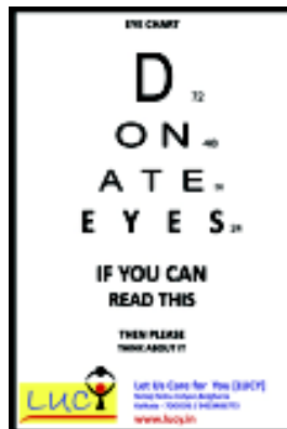
New IEC Material