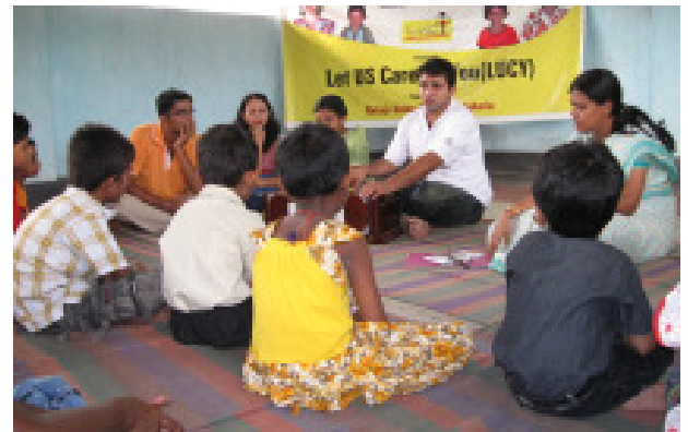
Singing Class for Project Smile Children