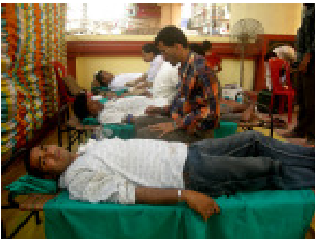
Blood Donation Camp of D.Y.F.I. Madhyamgram L.C.1