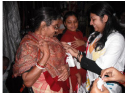
Sticker Campaign - World AIDS Day 2009