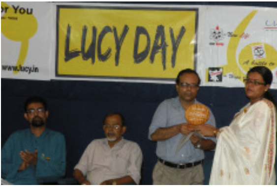
President presenting Memento on LUCY Day 2009